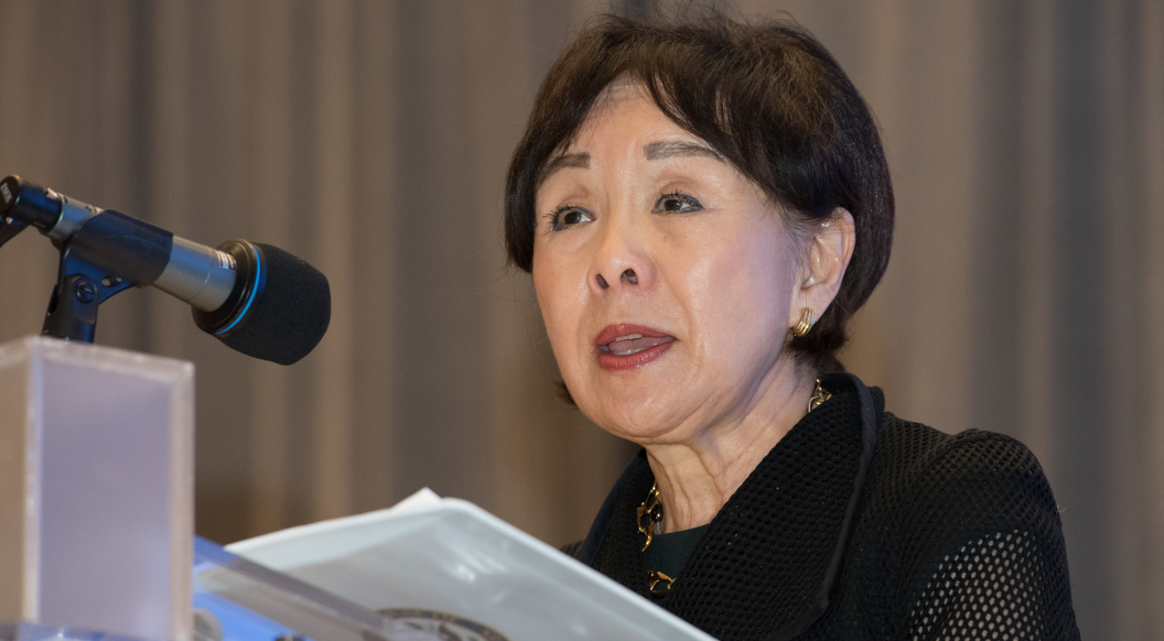
Above: Congresswoman Doris Matsui at 2019 Contains: Courage® FARE Summit.